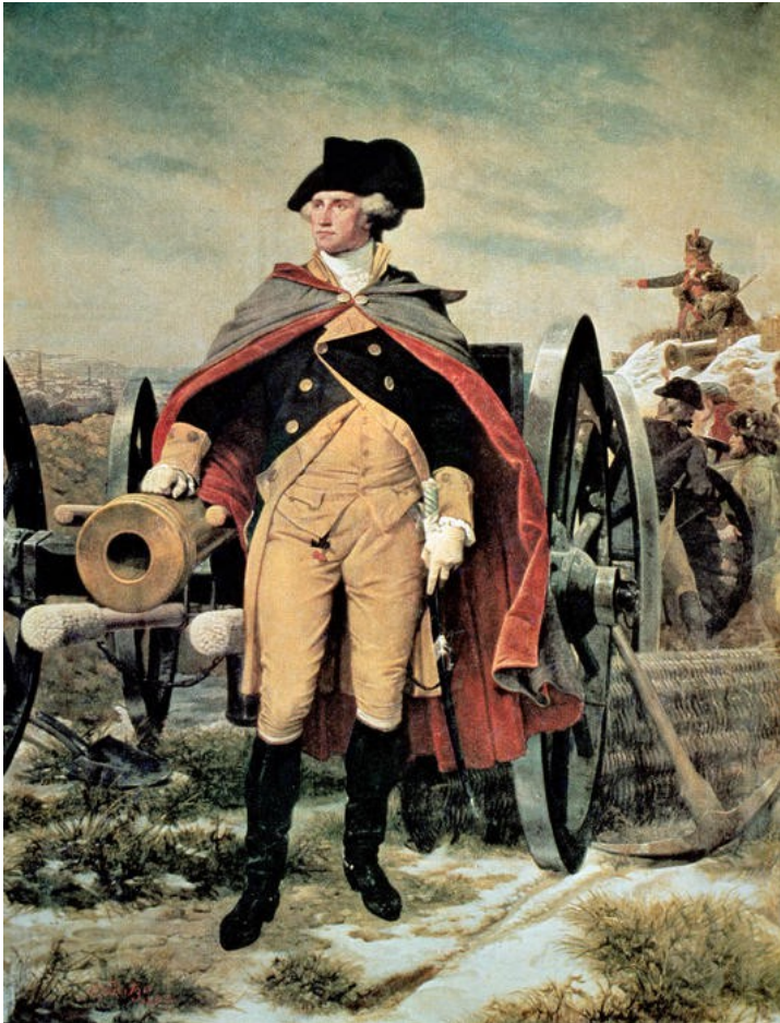
George Washington (Feb 22, 1732-Dec 14, 1799) Farewell Address to the Army 2 Nov 1783 First Inaugural Address 30 April 1789 Farewell Address 17 Sept 1796 A New Biography of Washington by Mark Twain General Washington's Negro Body-Servant by Mark Twain