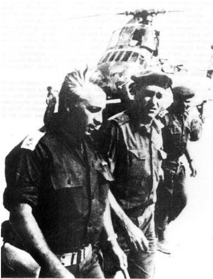
Major-General Ariel Sharon during the Battle of Abu-Geila.