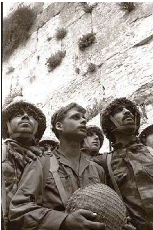
Israeli soldiers who captured the Western Wall.

http://www.realclearpolitics.com/articles/2015/06/10/a_brief_shining_moment_in_the_sorry_70s.html