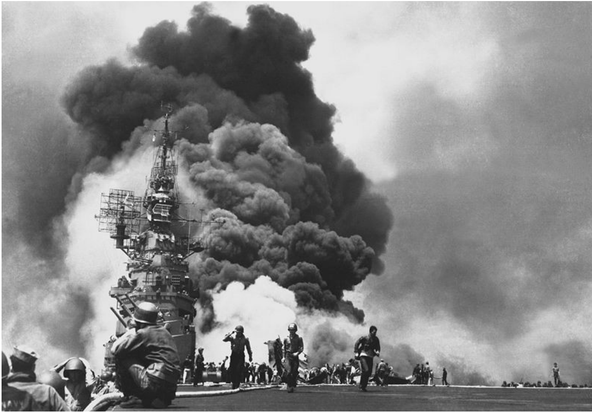
The aircraft carrier USS Bunker Hill, after being hit by two kamikaze planes within 30 seconds on May 11. Very heavily damaged, she was repaired in the U.S. and remained afloat (in various classifications) until 1973.

The Battle of Okinawa, codenamed Operation Iceberg, was fought on the Ryukyu Islands of Okinawa and was the largest amphibious assault in the Pacific War. The 82-day-long battle lasted from early April until mid-June, 1945. The battle has been referred to as the "Typhoon of Steel"... http://en.wikipedia.org/wiki/Okinawa_campaign