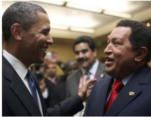
Socialist dictators think alike.

http://www.breitbart.com/article.php?id=D99P3IKO0&show_article=1