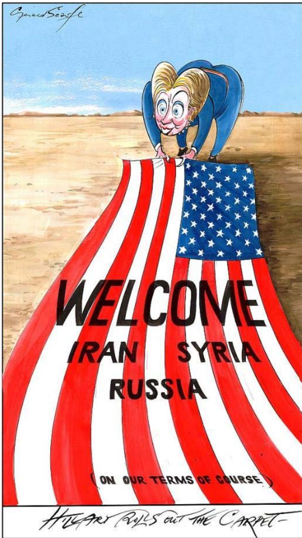
Gerald Scarfe, The Times, 11 March 2009